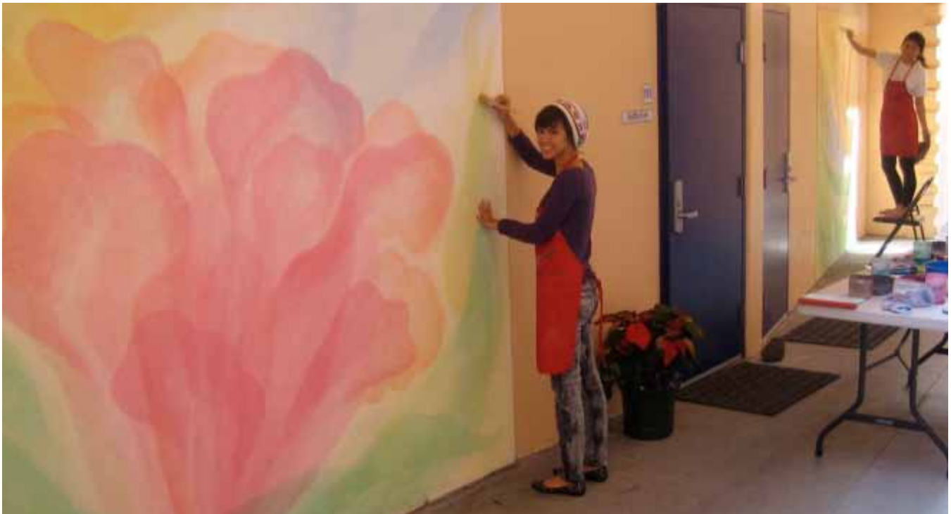
Two exterior murals at the Honolulu Waldorf School were painted by 12th grade students as part of an independent art project.

These festivals are appropriate for the schools in the temperate zone and in Christian countries. But since 1919 almost 90 years have passed and Waldorf education has spread worldwide, and there are questions with regard to the transplanting of Waldorf practices. For example how do we think