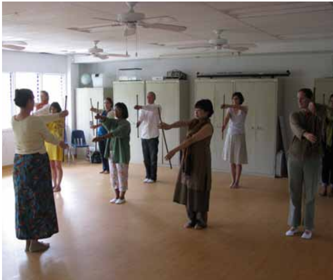
Workshops at the Hawai'i Kolisko Conference included eurythmy.

even included excursions to local Hawaiian attractions.