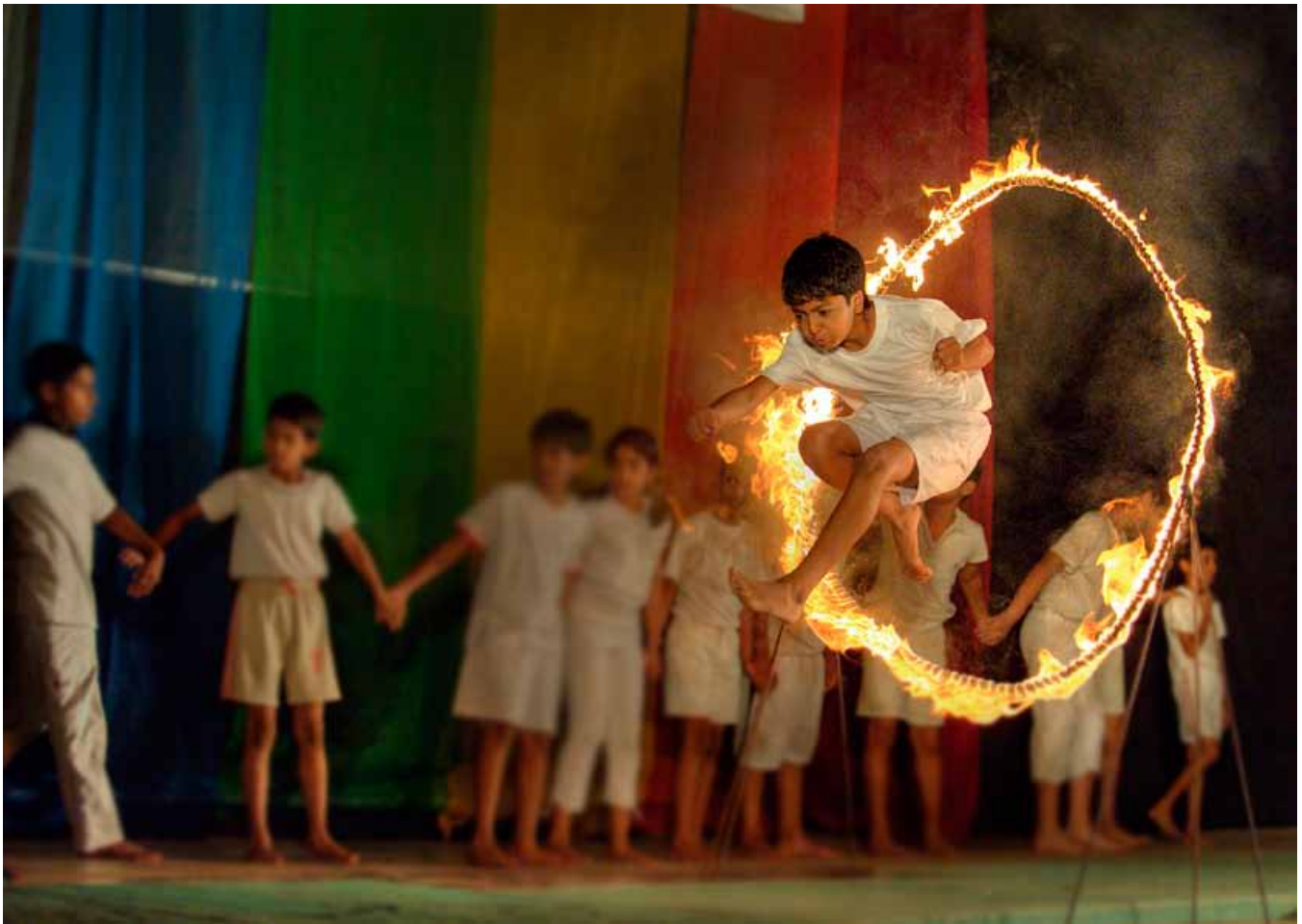
Asian festivals, like this one at Sloka Waldorf School in Hyderabad, India, can be very colorful and action-filled.

about certain festivals in the southern hemisphere and in non-Christian or mixed-culture countries? Each school also must work with its own regional festivals and celebrations. These questions play into the character of the Waldorf Curriculum. Some fundamental questions relating to the curriculum are as follows: