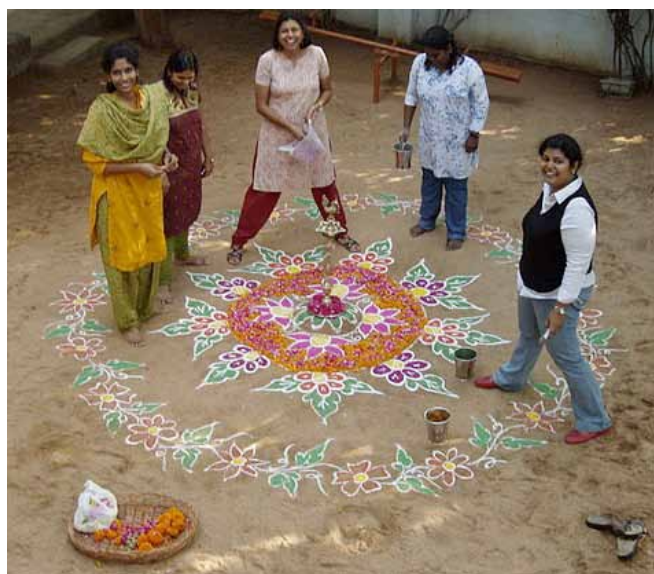
Indian festivals often include the creation of elaborate form drawings called Rangoli. This one was done in celebration of Diwali, a festival of light, at the Sloka Waldorf School in Hyderabad.