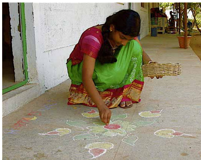
Rangoli is a colorful Indian visual art that acts as a temporary geomantic construction.