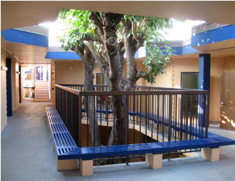
Second floor courtyard of the Honolulu Waldorf High School oceanfront campus.

nate, and even lavender, lilac, and violet tones are indicated for the more inwardly active, thoughtful work of the upper school adolescent. However, craft rooms are often appropriately painted with warm colors, and spaces for eating are aided by appetite sympathetic golden-orange tones. The interior colors in a Waldorf school are meant to support the child's general phase of development at the same time as to enhance the educational experience for the particular grade level. Each classroom is a unique space for a specific age group and its activities. Therefore, each classroom wears a color appropriate to that space, the age of the students, and what generally takes place in it.