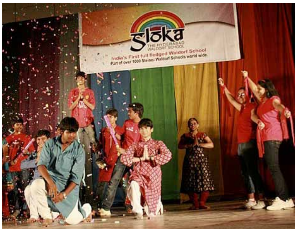
Music, speech, dance, drama, visual and performing arts are usually the vehicle for any festival.

a) It is important for us to celebrate the four original Waldorf festivals, even if we do so only on a small scale. We think these festivals touch the universal human soul. We are not dogmatic about these festivals, neither do we wish to easily change them.