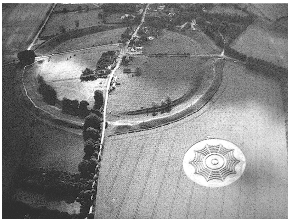
Crop Circle beside ancient megalithic monument in southern England.

negative energies called geopathicstress zone. And if a living beings stays to long in a geopathicstress place it can affect its health, causing diseases, sleeping disorders etc... This is where geomancy comes in, as it will be use to heal the earth and through this, heal the living beings living in the upset area.