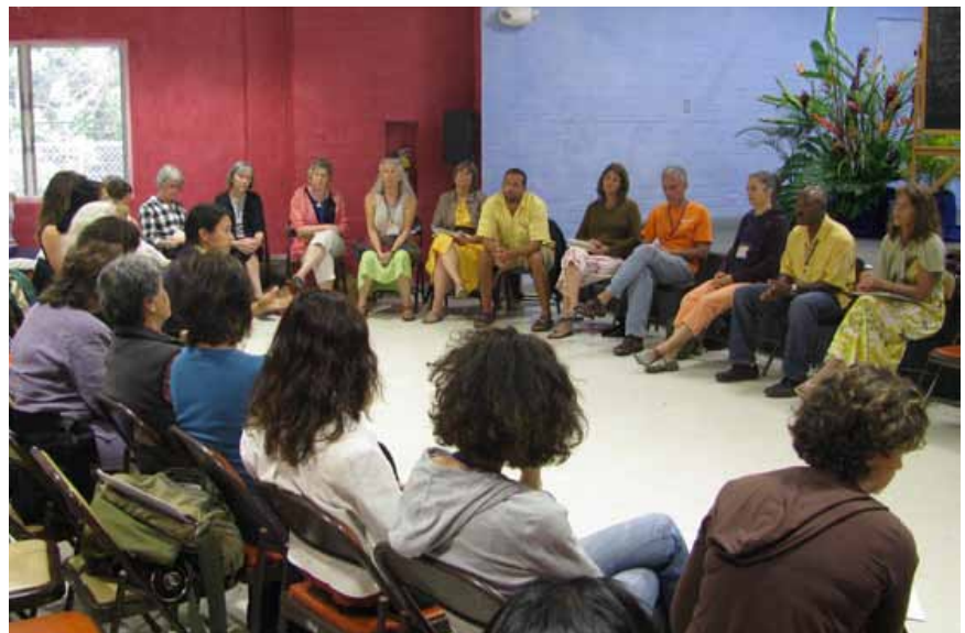
Second floor courtyard of the Honolulu Waldorf High School oceanfront campus.

Waldorf High School were selected with the following considerations in mind: a building for adolescents to learn and live in, the surrounding natural environment, and a unique aesthetic contribution to the local community. The oceanside campus site in East Honolulu has been renovated and upgraded to serve as the new home for the Honolulu Waldorf School's upper classes. Its exterior is painted in a peach color with accents in a contrasting ultramarine blue. Peach is a warm, nurturing, heart-felt color, inviting and accepting. It is a similar hue to that of the lower school buildings in Niu Valley and is a healthy, natural tone.