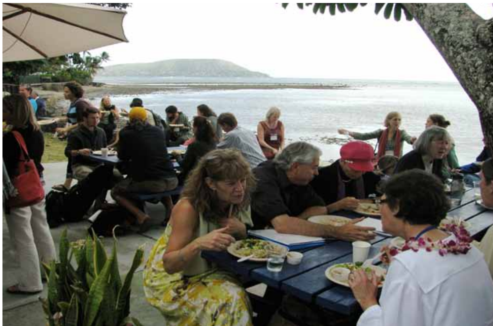
The Hawai'i Kolisko Conference venue was the new Honolulu Waldorf High School campus on the south shore of O'ahu.